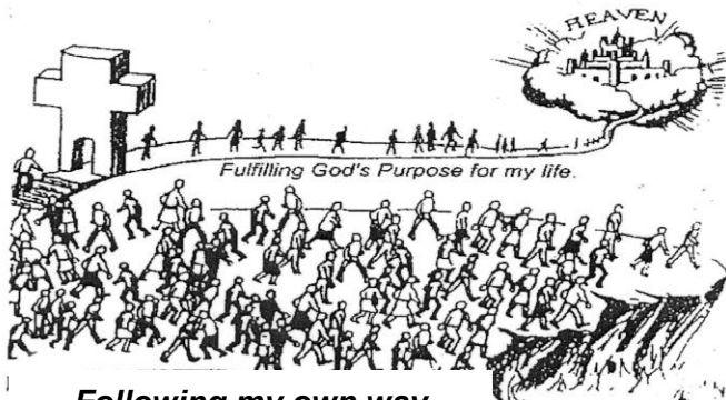
Following my own way

HEART WITH CHRIST ON THE THRONE walks the narrow way to Heaven.