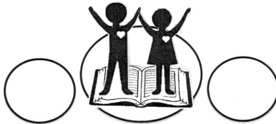
FACTS – Fig. 2