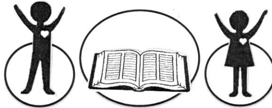
FACTS – Fig. 1